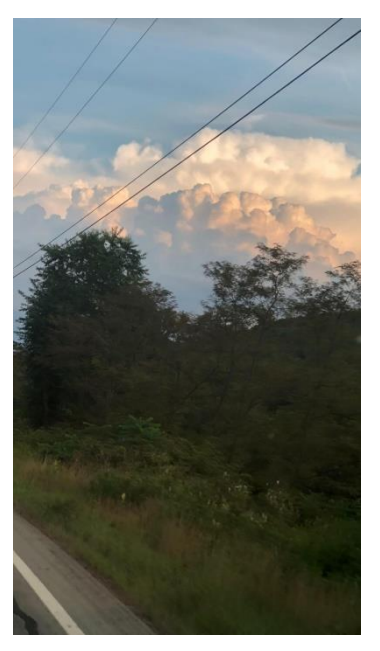
(continued on next page)